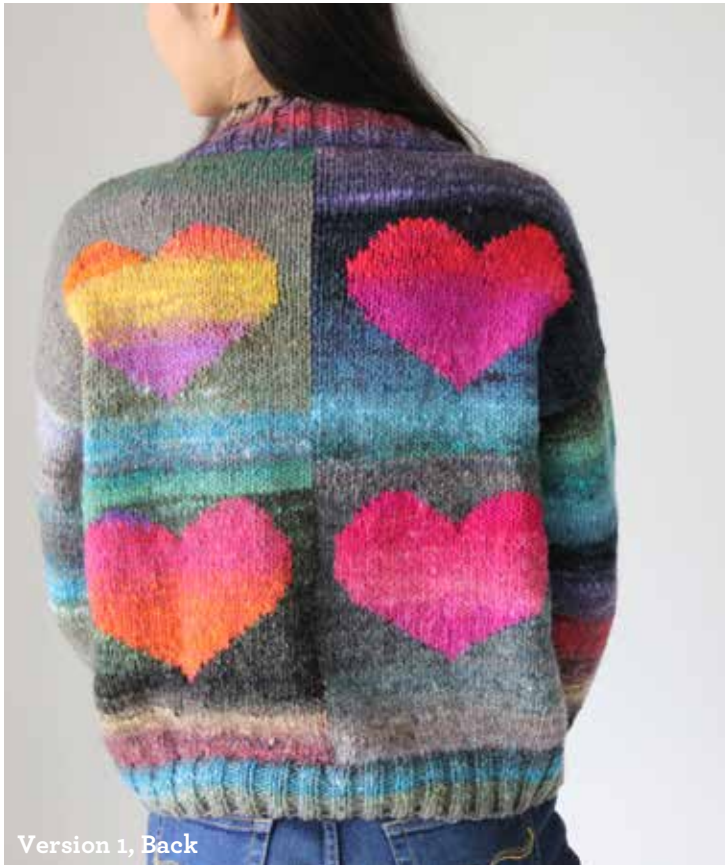
Version 1, Back